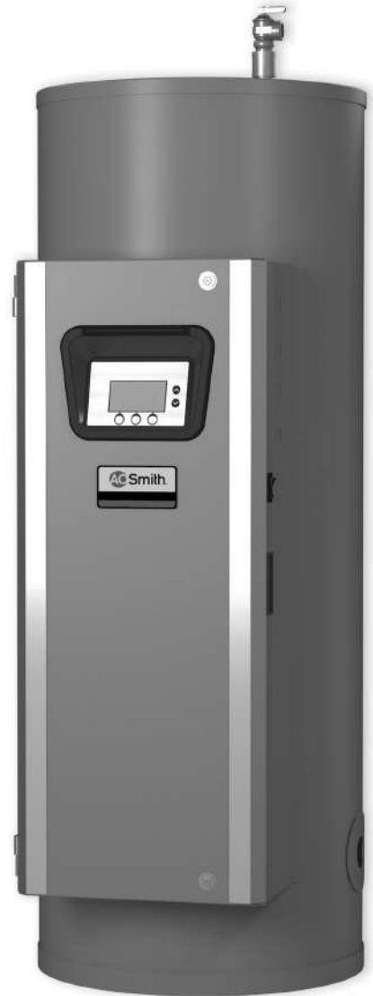
DSE-5A thru DSE-120A (DSE-100A Shown)