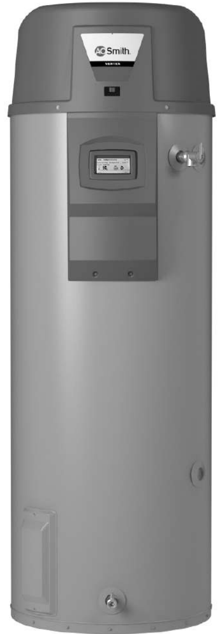
MODEL SHOWN GDHE-75

Model GDHE-50 *4.31 GPM continuous flow, based on 65°F inlet water temperature, 110°F outlet temperature.