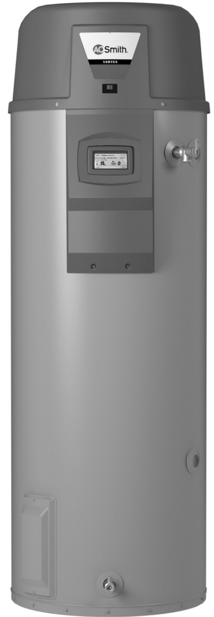
MODEL SHOWN GDHE-75

Model GDHE-50 *4.31 GPM continuous flow, based on 65°F inlet water temperature, 110°F outlet temperature.