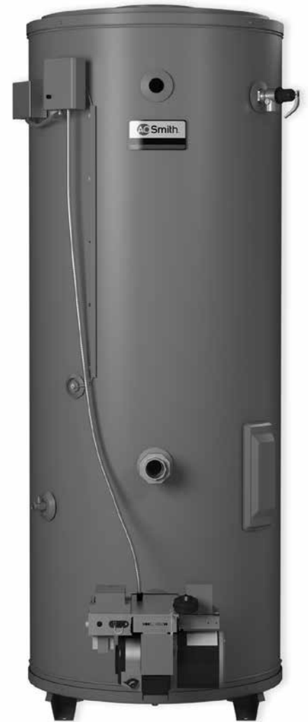
MODELS COF-199 THROUGH COF-700(A)