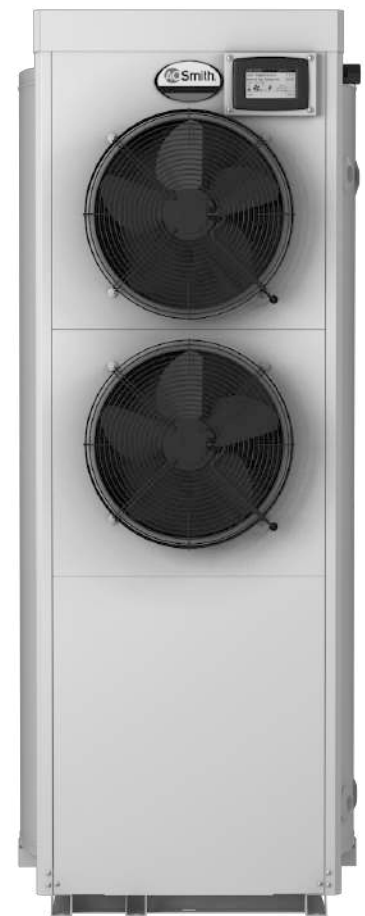
MODEL CAHP 120