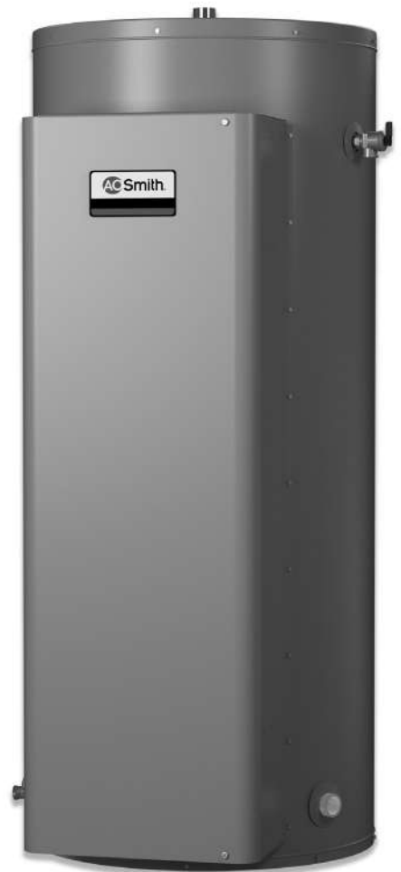
MODELS DRE-52, 80, 120