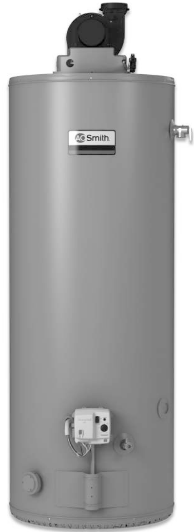
BTF-80 SERIES 210/211

For complete warranty information, consult written warranty or contact A. O. Smith